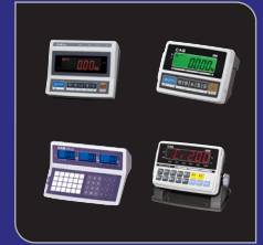
Connectivity with various CAS indicators