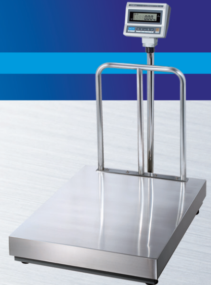
▲ ex) SPS connected with DBI indicator